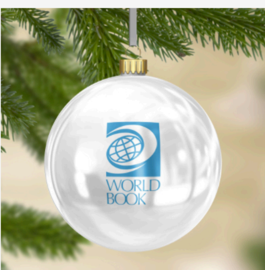
Holidays with WBO Thursday, November 11th (3:30 p.m. CST)