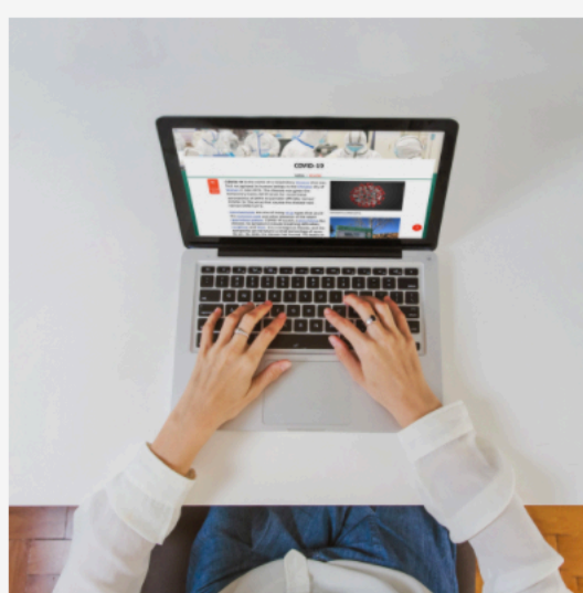
Toolsets for Researchers Tuesday, November 16th (2:30 p.m. CST)