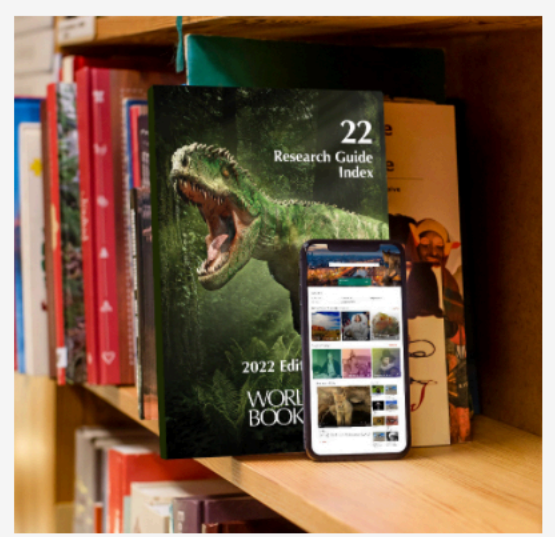
Beyond Devices Tuesday, November 30th (12:00 p.m. CST)